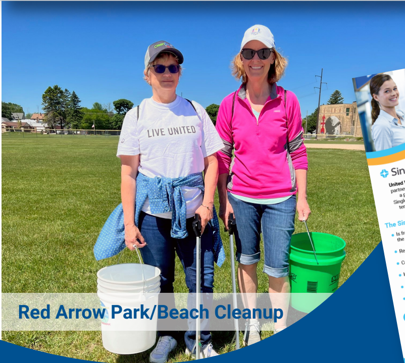
Red Arrow Park/Beach Cleanup